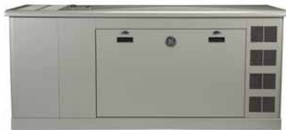
48kW 1 Home Generator System

To learn more, visit www.ge.com/generatorsystems